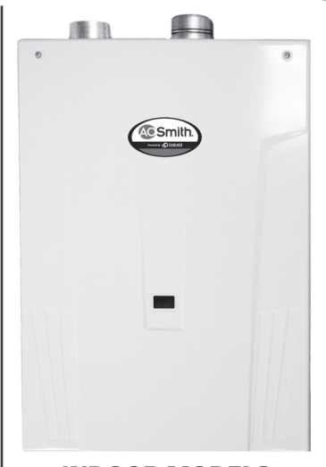
INDOOR MODELS ATI-520H-N ATI-520H-P