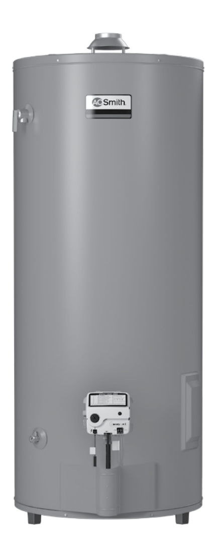
BT-80 & BT-100

• For complete information, consult written warranty or go to hotwater.com